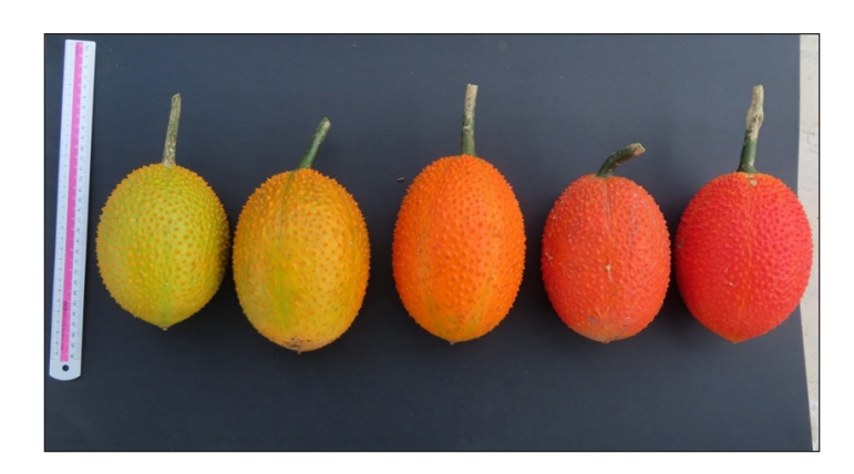
Figure 2. Gac fruits with different maturity index

The gac fruits, manually harvested at maturity index 4, had bright and vivid orange-red peel colors, with vibrant orange to reddish-orange skin, bright red or deep orange pulp, and a firm but slightly yielding texture. The fruits are harvested at maturity stage four because this stage represents the optimal point for several important physicochemical properties (Tran et al., 2016). At this stage, the gac fruit exhibits the highest levels of beneficial compounds, such as lycopene and beta-carotene, which are important for their antioxidant properties. The texture is also ideal for processing and consumption. Harvesting at this stage ensures the best nutritional content, flavor, and texture quality, making it suitable for fresh consumption and further processing. Additionally, data on the number of fruits per plant were recorded daily and summed up during the harvesting period.